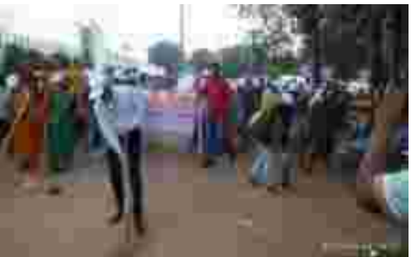
Swachhata Hi Sewa Abhiyan held both at Branch MSME-DI, Rourkela and Rayagada on 23.9.18 and 24.9.18 respectively.