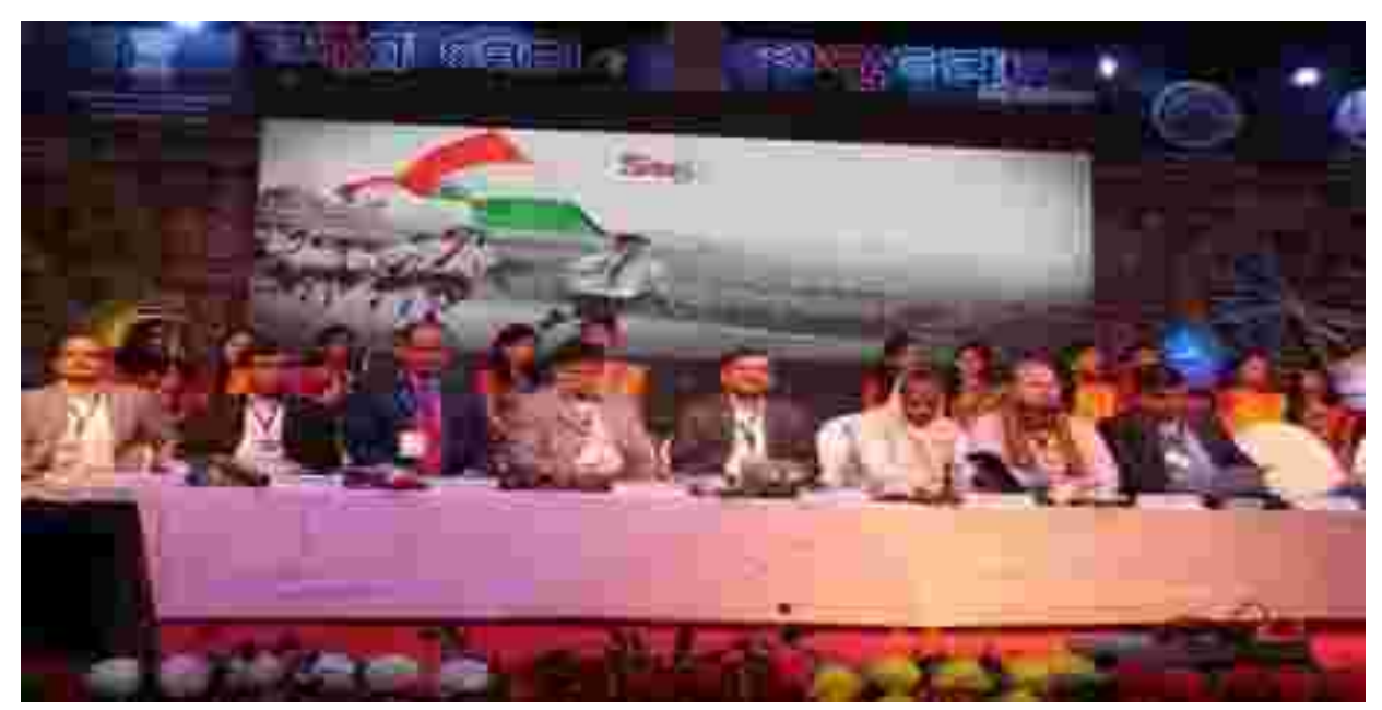
National Trade Fair cum Expo Odisha 2019 organized by MSME DI Cuttack in association with Balasore Chamber of Commerce and Industries (BCCI) was held at Balasore from 23<sup>rd</sup> January to 27<sup>th</sup> January 2019. Around 600 MSMEs participated in the Trade Fair.